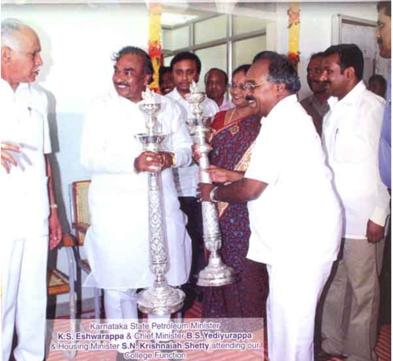
Karnataka State Petroleum Minister K.S. Eshwarappa & Chief Minister B.S. Yediyurappa & Housing Minister S.N. Krishnaiah Shetty attending our College Function